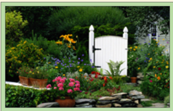
WHAT KIND OF VOICE DOES GOD USE?

God doesn't use a voice like we do--a vocal voice. God uses everything to speak to us. The primary way that God speaks to us is through scripture, which is why we call it the Word of God. But God's voice is richer and greater than that. God speaks to us through our hearts and minds, generally when we are quiet and still enough to hear. God speaks to us through people around us, especially those with wisdom and spiritual depth. God speaks through symbols, nature, experiences, art, books, television, and pretty much everything that can communicate a message.